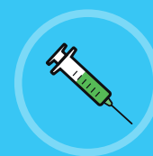
Get vaccinated against the flu, covid and some types of gastroenteritis

Children and vulnerable people who are ill must see a doctor . If the doctor is unavailable, dial 15