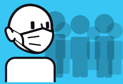
Wear a mask in crowded places or if you are ill