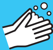
Wash your hands